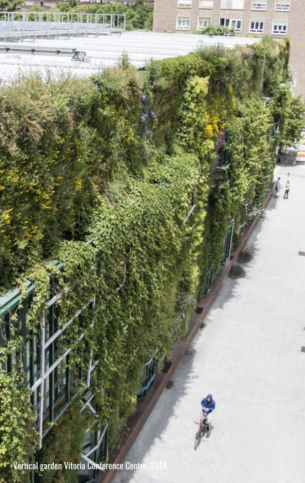
Vertical garden Vitoria Conference Centre, 2014