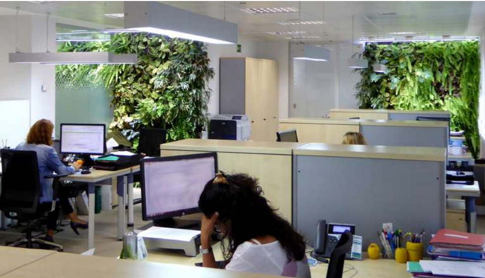
Vertical Gardens at Ferring Office, Madrid 2019