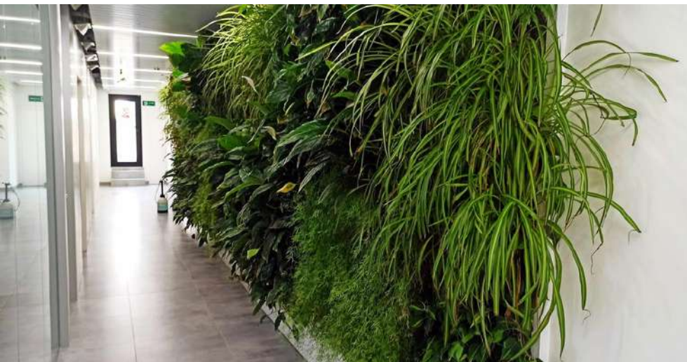
Vertical Garden at Alicante University Building, Alicante 2020