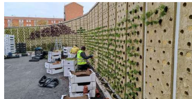
Vertical garden, Grupo Alacant. Alicante, 2022