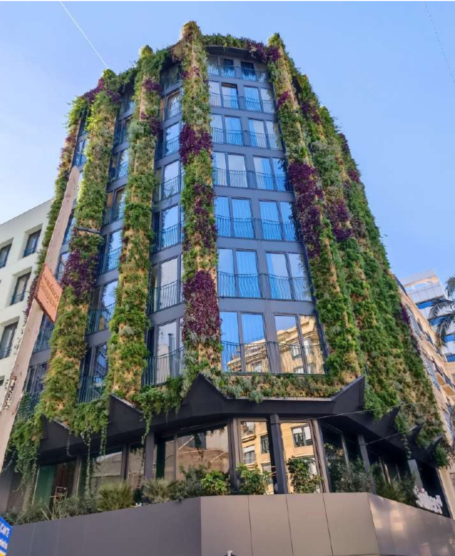
Vertical Garden at Suiters Building, Alicante 2022