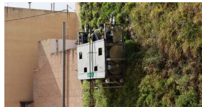
Vertical garden at San Vicente, Alicante, 2019