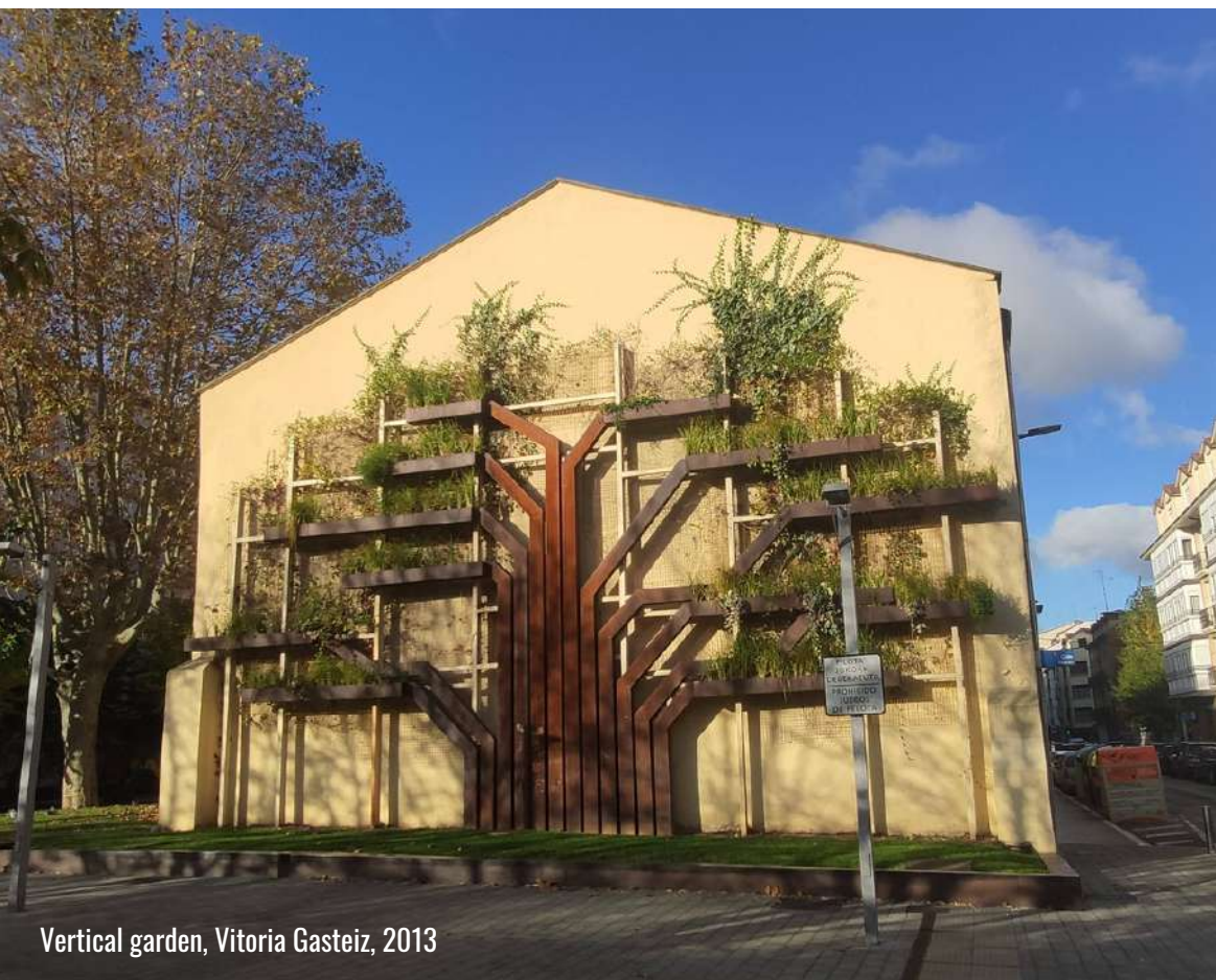
Vertical garden, Vitoria Gasteiz, 2013