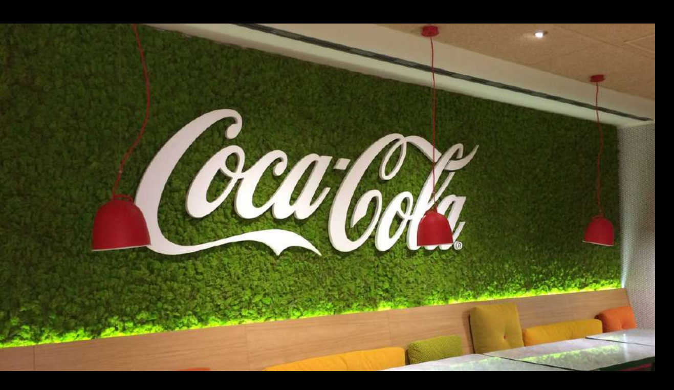
Coca Cola, Madrid, 2015