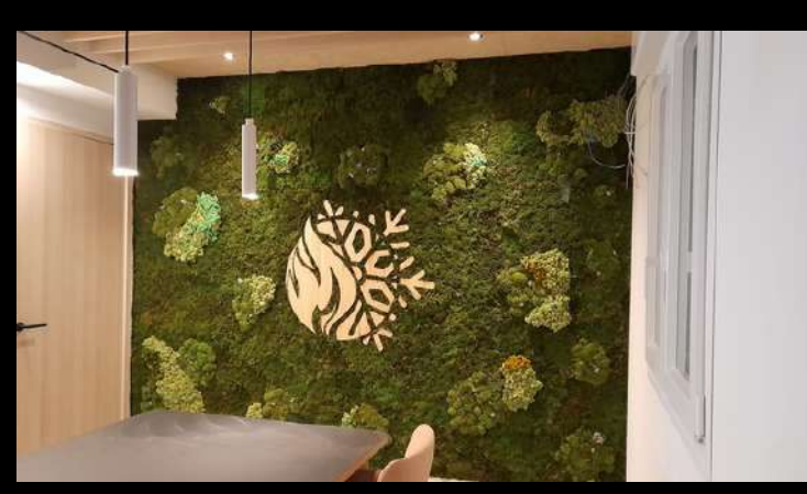
Davofrío Offices, St. Vincent, 2021