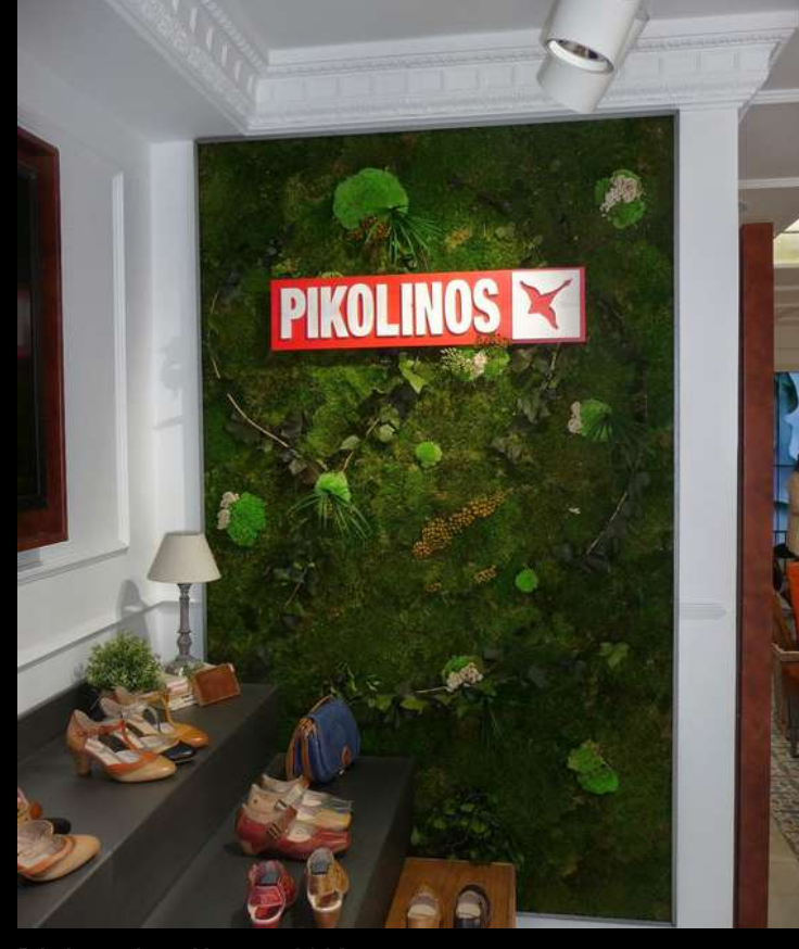
Pikolinos shop, Alicante, 2014