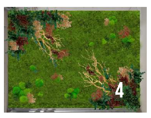
Design proposals for Davofrío offices, San Vicente, Alicante, 2021