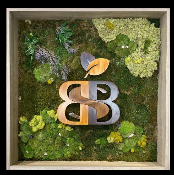
BioBanús - Biocosmética (Marbella)