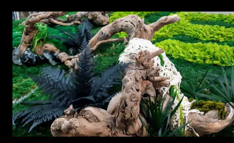
Gureak, Guipuzcoa, 2018