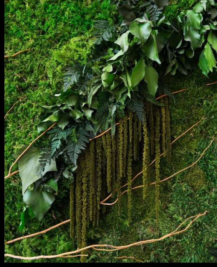
Residential building Palma, 2016